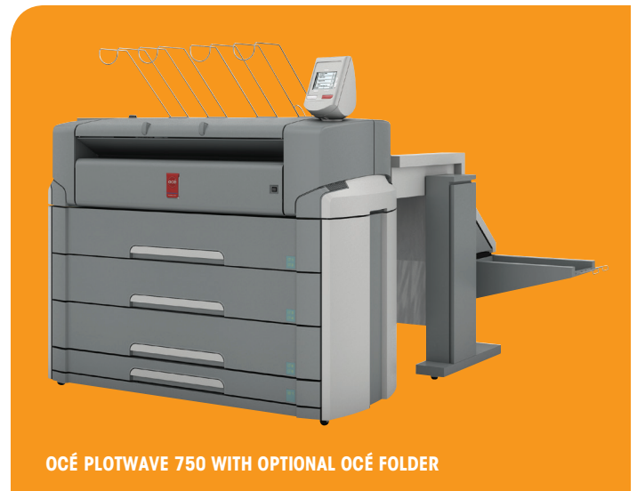
Océ PLOTWAVE 750 WITH OPTIONAL Océ FOLDER