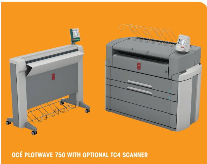
Océ PLOTWAVE 750 WITH OPTIONAL TC4 SCANNER

Meet short deadlines and work efficiently with the instant-on performance of Océ Radiant Fusing technology. Get over 27 D-size (A1) size prints, before others have even started printing and consistently turn out 9 D-size (A1) prints per minute, even with mixed sizes. With 6 media rolls, the Océ Double Decker Pro stacker and built-in cutters, you can print and stack up to 3,444 feet (1,050 meters) of output without interruption. Scan and copy as-builts, color markup and other technical documents in one quick and easy step for immediate archiving and distribution.